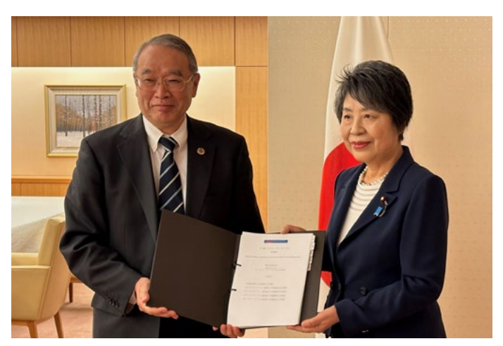
Left to right: Nobuhiro Endo and Foreign Minister Kamikawa