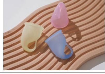
REQUEST FOR DISTRIBUTOR Sector: environment

Japanese company is looking for a distribution partner in the EU for their sludge-dewatering equipment Profile ID: BOJP20230127002